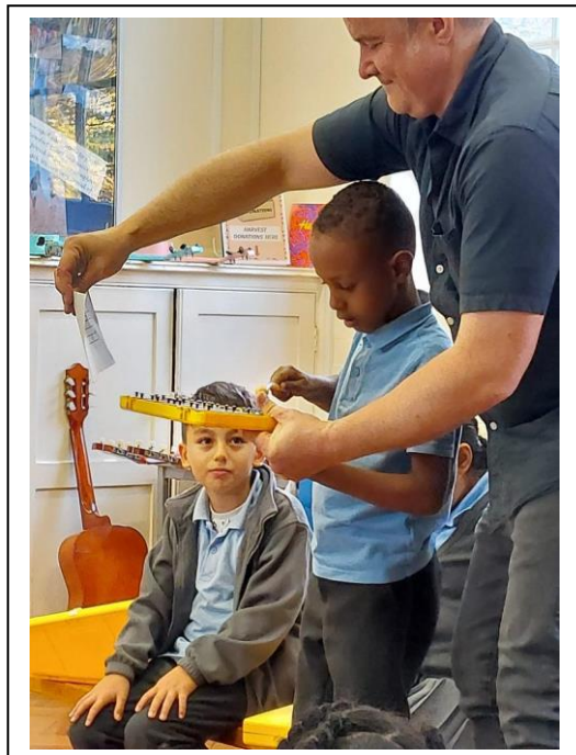
Children are enjoying their music lesson at Comber Grove Primary School.