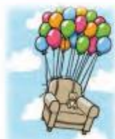
chair in the air