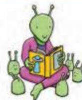
get near to hear