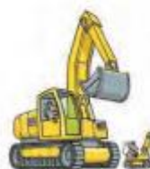
a bigger digger