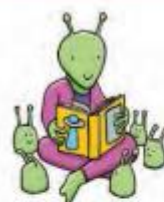
get near to hear