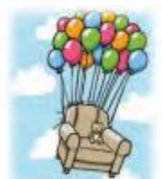
chair in the air